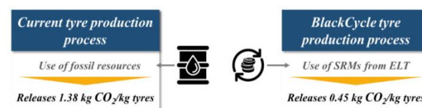
Figure 2. Carbon footprint comparison between production process

The BlackCycle project aims at creating, developing, and optimising a full value chain from ELT feedstock to Secondary Raw Materials (SRMs), with no waste of resources in any part of the chain and a specific attention for the environmental impact. These SRMs will be used to develop new ranges of passenger car and truck tyres, which will be sold commercially in European and global markets. As a result, the BlackCycle value chain as a lower carbon footprint (see Figure 2), emitting 0.93 kg/CO 2 /kg tyres less and a lower using of fossil resources, using 0.89 kg fossil/kg ELT less.